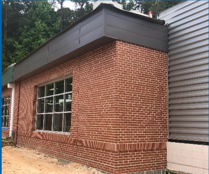
Metal Panel Soffit Complete