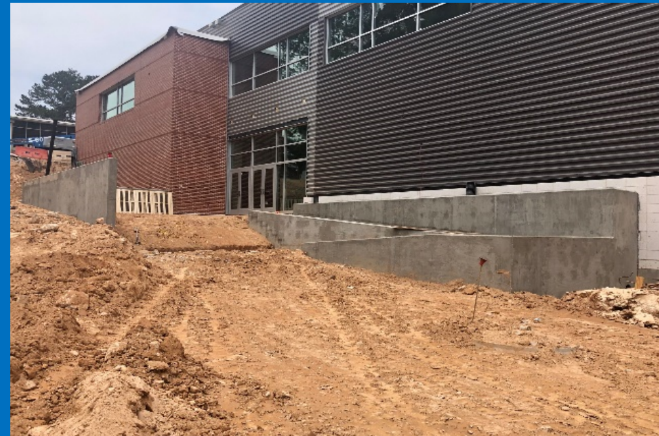
Gymnasium Site Ramp and Stair Concrete