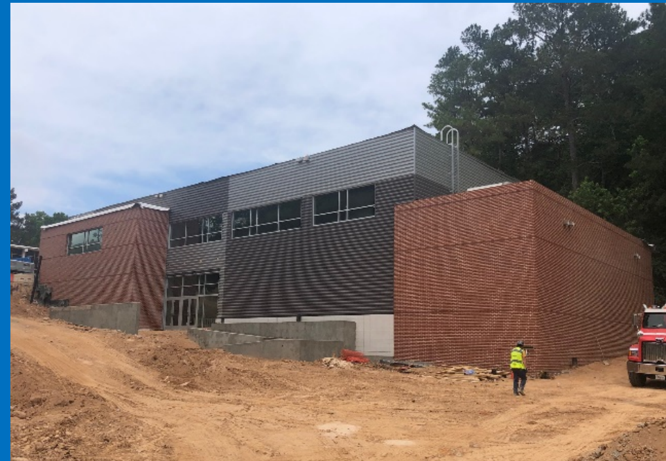
Gymnasium North East Elevation Progress