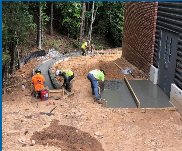
Concrete Flume and Pad Pour