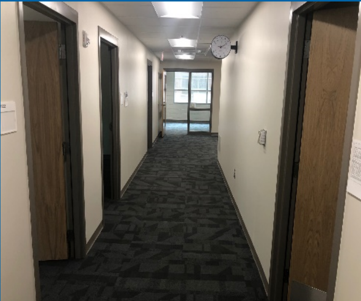
Admin Area Complete and Final Clean