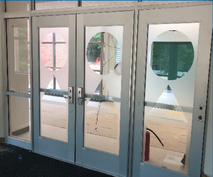
Storefront Frosted Film Installed